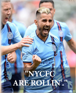
"NYCFC ARE ROLLIN'."