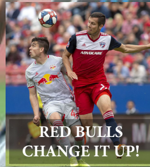
RED BULLS CHANGE IT UP!